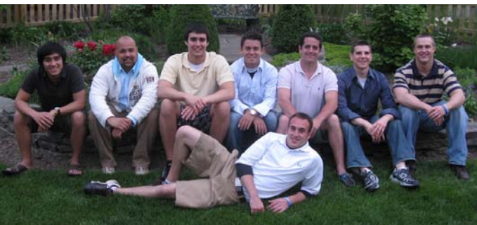
Soon-to-be alumni at the Senior Send-Off this past May