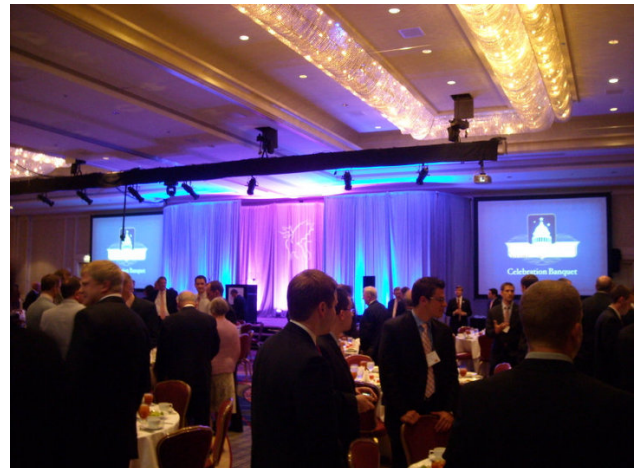
The Grand Ballroom at the Crystal Gateway Marriott