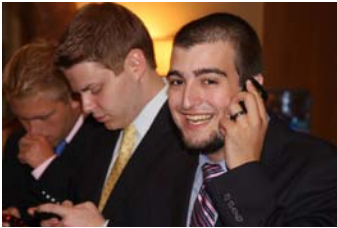
Brothers calling, texting, and "tweeting" the good news!