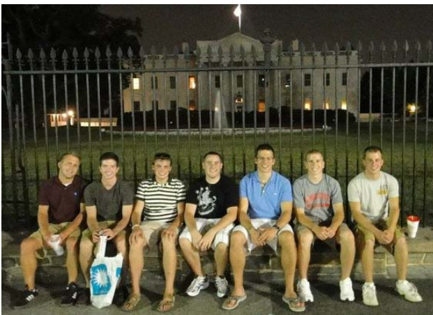
Brothers outside of the White House concluding our history-making day