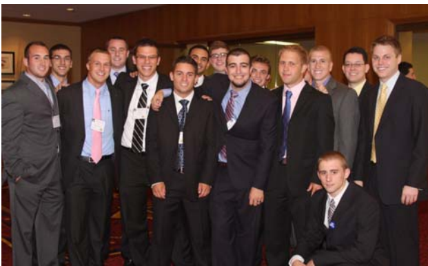
Patiently waiting outside the Convention Hall to hear our results