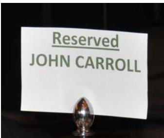
The "Reserved" table signs told the story—no other chapter had that.