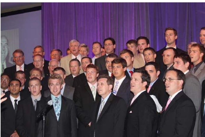
Marching along: A dozen JCU Betas joined many more brothers from across the country on stage for the Convention Chorus (some are seen lower left).