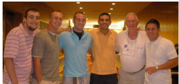
ABOVE: Brothers met Betas of all generations during Convention.