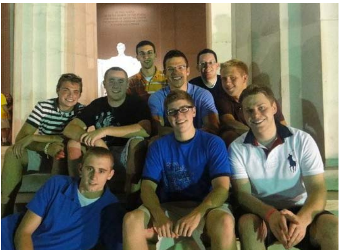
A midnight rendezvous: Brothers meet up on the steps of the Lincoln Memorial to end a long but fun day in Washington, D.C.