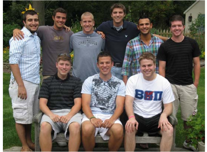
2010 Executive Board at their summer planning retreat