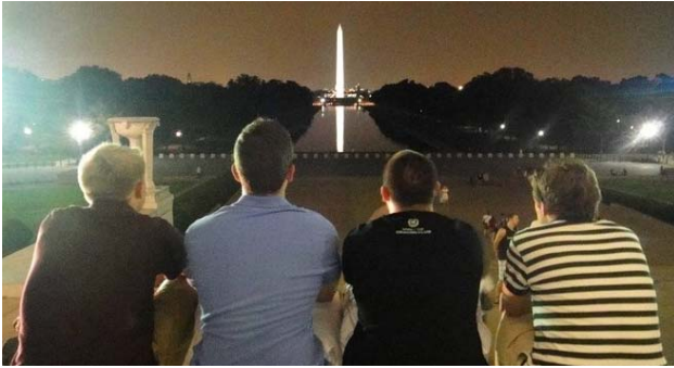
Brothers look out at the Washington Monument and Reflecting Pool from the stairs of the Lincoln Memorial